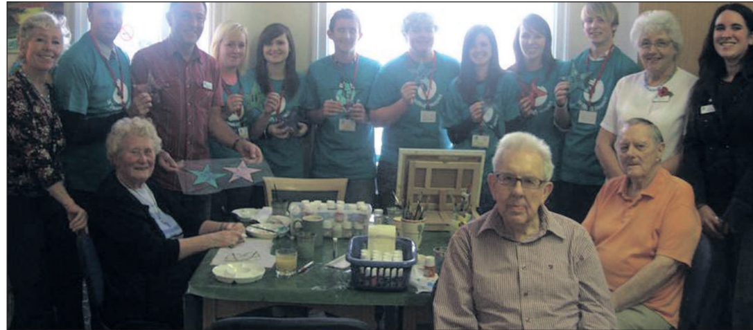
Pupils from Hailsham Community College with St Wilfrid's Hospice Day Therapy Clinic patients.

Enterprising students from Hailsham Community College are working with St Wilfrid's Hospice to raise vital funds for this local charity. The innovative students are pictured here with Hospice's Day Therapy Clinic patients who have been busily painting stars in preparation for St Wilfrid's Christmas Magic event in Eastbourne on December 5 and 6, 2009.